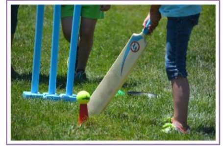
USYCA Youth Cricket

The website will have all the information that a new club would need, in as simplified format as possible.