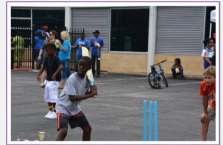
Cricket at Block Parties