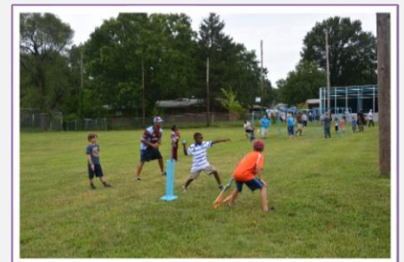
Cricket at Community Events