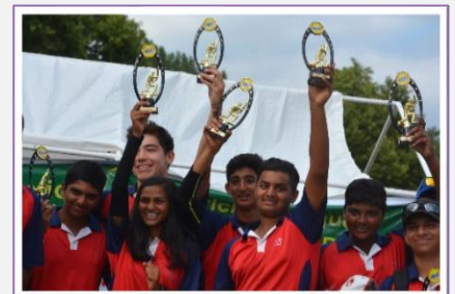
National Youth Championships